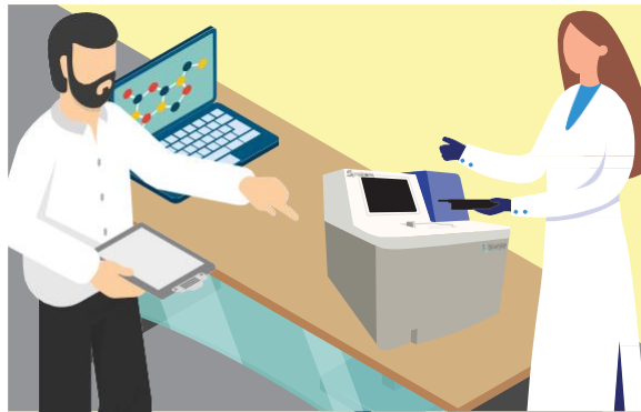
Table Top Size Machine